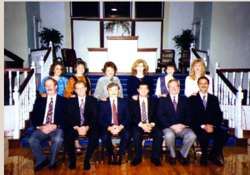
Dedicated Pastors, Teachers and Christian Leaders in a classroom setting

The world today is destitute of the true teacher of righteousness. That is our goal and vision—to produce men and women that will be able to teach the difference between the holy and the profane. The time is short; the greatest revival the world has ever known is yet to come; and we do not want to miss the opportunity that God is putting before us.